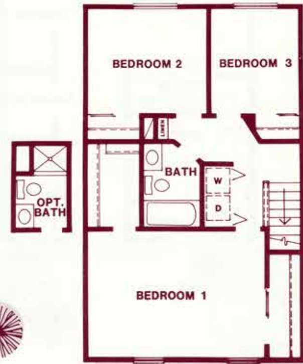
LEXINGTON PLAN 1200

*All floor plans subject to change without notice.