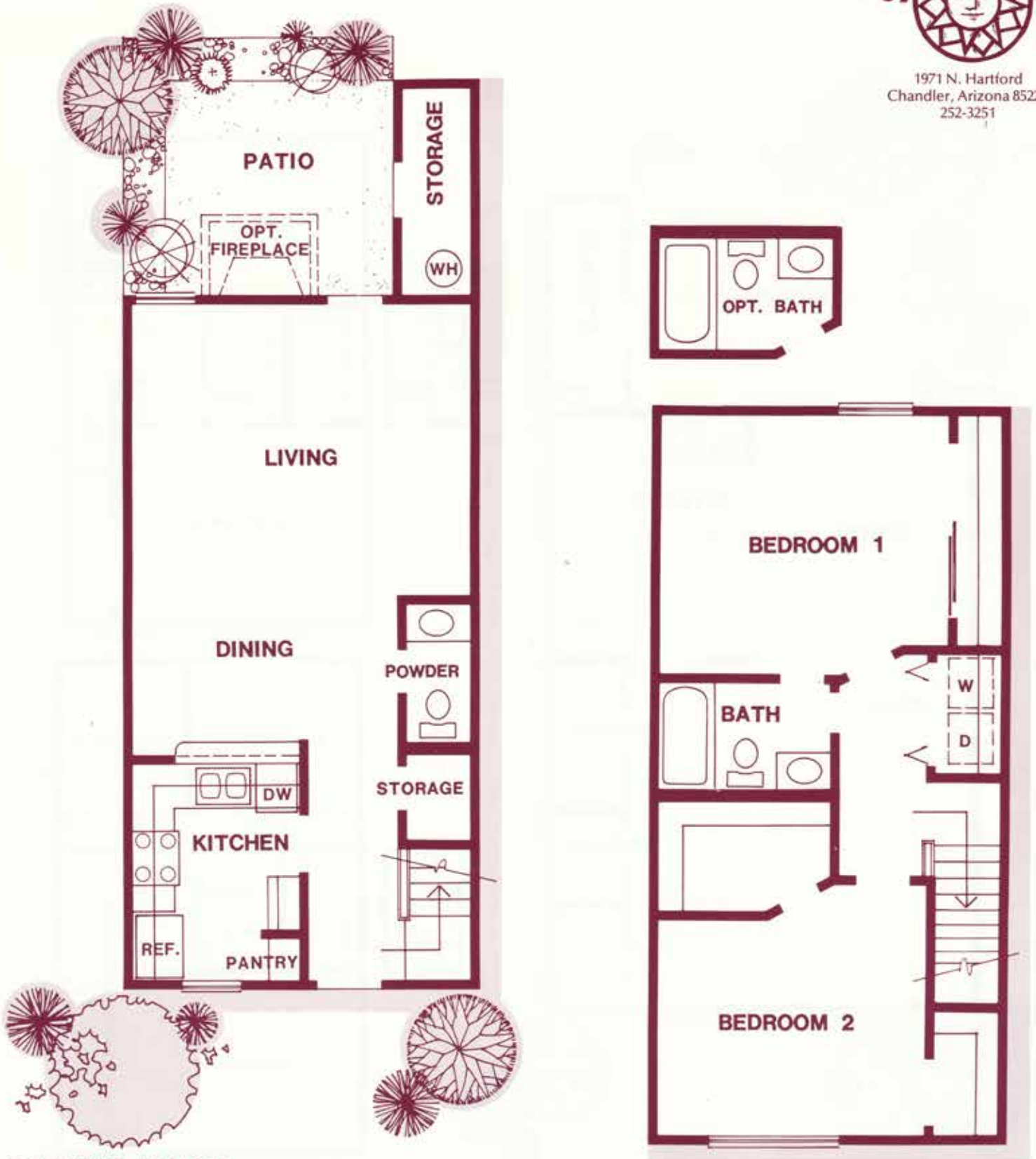
CAMBRIDGE PLAN 1056

1971 N. Hartford Chandler, Arizona 85224 252-3251