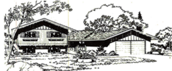
THE HORIZON . . . PLAN 19, Elev. D Four Bedrooms — Three & 1/2 Baths Breakfast Area — Sewing Room Recreation Room — Dining Room Tri-Level 2360 Sq. Ft. Habitable