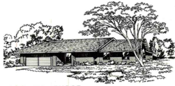
THE PARKWOOD . . . PLAN 744, Elev. A Four Bedrooms — Two Baths Family Room Single Level 1577 Sq. Ft. Habitable