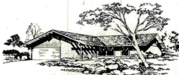
THE STARLIGHT . . . PLAN 620, Elev. A Three Bedrooms — Two Baths Family Room Single Level 1274 Sq. Ft. Habitable

BEAUTIFULLY FURNISHED MODELS OPEN SUNDAY THROUGH FRIDAY 9AM TO 9PM AND SATURDAY 9AM TO 7PM