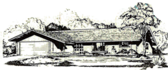
THE HOLIDAY . . . PLAN 8, Elev. E Three Bedrooms — Two Baths — Family Room Dining Room Single Level 1839 Sq. Ft. Habitable