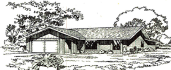
THE CAMELOT . . . PLAN 734, Elev. A Three Bedrooms — Two Baths — Family Room Single Level 1521 Sq. Ft. Habitable

6 TEMPE FAIRWAY ESTATES Rural Rd. 1½ mi. S. of Baseline Phone 264-8688 • Tempe