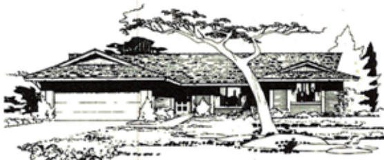
THE ARCADIA . . . PLAN 17, Elev. D Four Bedrooms — Two Baths — Family Room Dining Area Single Level 1980 Sq. Ft. Habitable

12 CASA DEL REY 48th Ave. & Bethany Home Rd. Phone 264-8631 • Phoenix