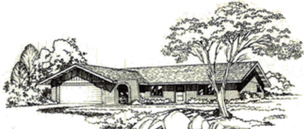
THE REGENCY . . . PLAN 630, Elev. A Three Bedrooms — Two Baths — Family Room Single Level 1168 Sq. Ft. Habitable

1 WEST SIDE ESTATES 67th Ave. N. of Camelback Phone 264-8990 • Glendale