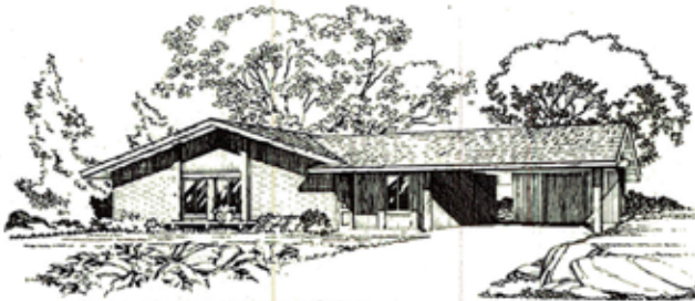
THE WEDGEWOOD . . . PLAN 726, Elev. A Three Bedrooms — Two Baths Family Room Single Level 1422 Sq. Ft. Habitable

16 PARK PREMIERE 1 mi. S. of Baseline Rd. on Rural Phone 264-8991 • Tempe