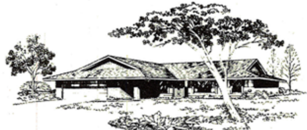
THE VOGUE . . . PLAN 720, Elev. C Three Bedrooms — Two Baths — Family Room Single Level 1458 Sq. Ft. Habitable